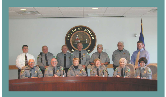
St. Joseph Police Department Retired Volunteers .

Duties: Monitor parking areas reserved for handicap persons, city pay to park facilities and write citations for violations as needed. Observe and report suspected criminal activity, conduct vacation home checks, issue fire lane warnings, report any hazardous conditions, patrol school playgrounds, parks, and nature areas to assist in assuring safety of children and citizens. Provide traffic protection or direction as needed when directed by police and crowd control during city events.. Attend monthly meetings and work one day a week..